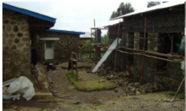
Renovation of Health Centre Kitchen