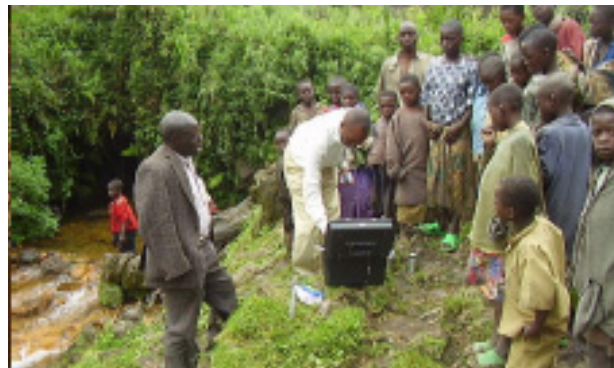
Environmental Health Assessment, Including Water Testing