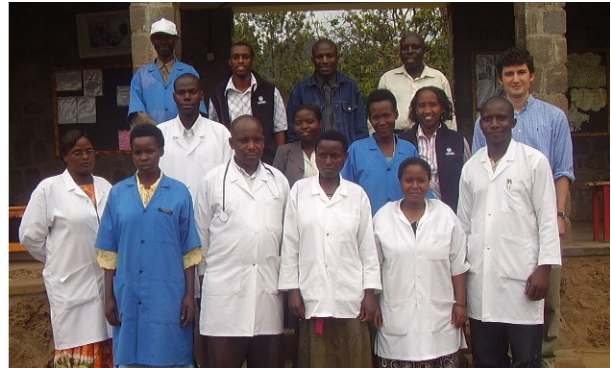
Staff of Shingiro Health Centre

Leadership Development is designing a management learning program for the CCHIPs team, and is also creating accompanying train-the-trainer materials that can be used first by the team